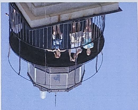
A Gull's Eye View

Beavertail Lighthouse Museum Association PO Box 83 Jamestown, RI 02835-0083